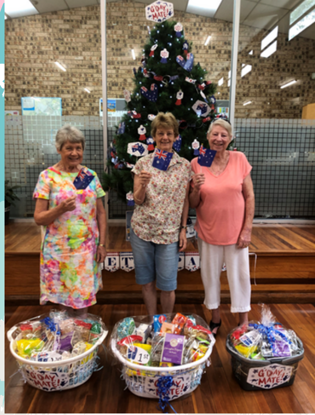
Our Lucky Raffle winners