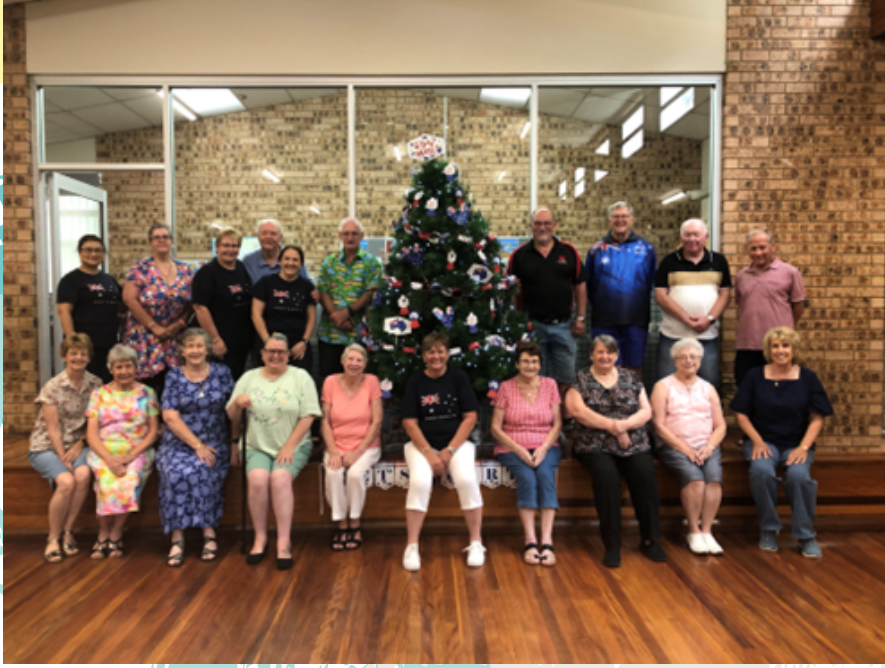
Australia Day BBQ Lunch Celebrations