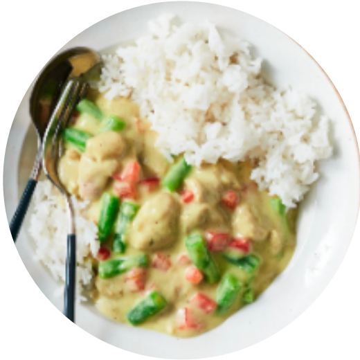
Thai Green Chicken Curry (This is yummy with a crisp green salad)