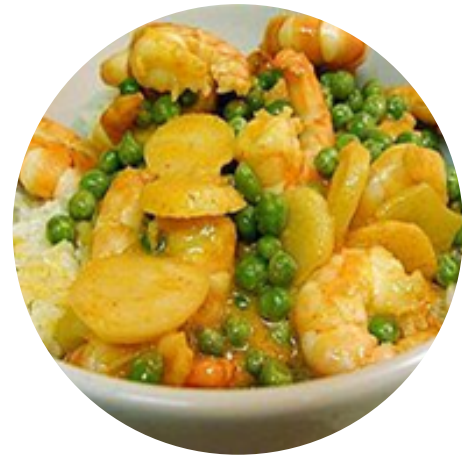
CURRIED PRAWNS (Top up with our Fried Rice Snack Pack. )